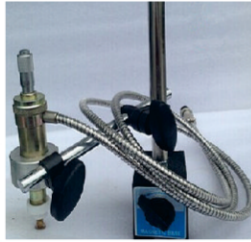
External/Internal spring length gage 外置/内置检长系统