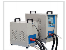
High frequency heating machine 高频加热机