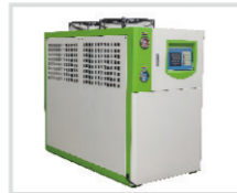
Water cooler 冷水机